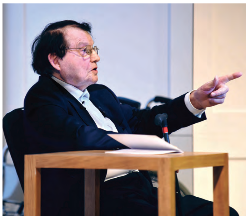
Professor Luc Montagnier

Montagnier told the conference that, under the right conditions, electromagnetic signals can be transmitted from test tubes containing a highly diluted DNA sample to a different test tube containing only water and that, when enzymes which copy DNA molecules are then added to this water, they behave as if DNA molecules are present, producing new DNA molecules (2009). This 'teleportation' effect of the DNA, from one test tube to another was found to occur only when the homeopathic procedure of sequential dilution, with vigorous shaking of the test tube was utilised. Also, Montagnier was co-author, with several highly respected scientists, in another article that was published in a leading scientific journal (2015). This article posits quantum effects beyond simple chemistry.