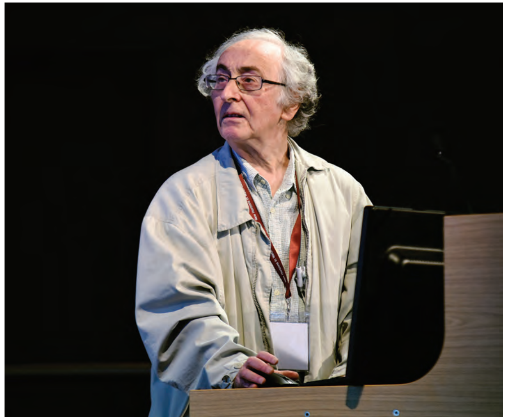
Professor Brian Josephson